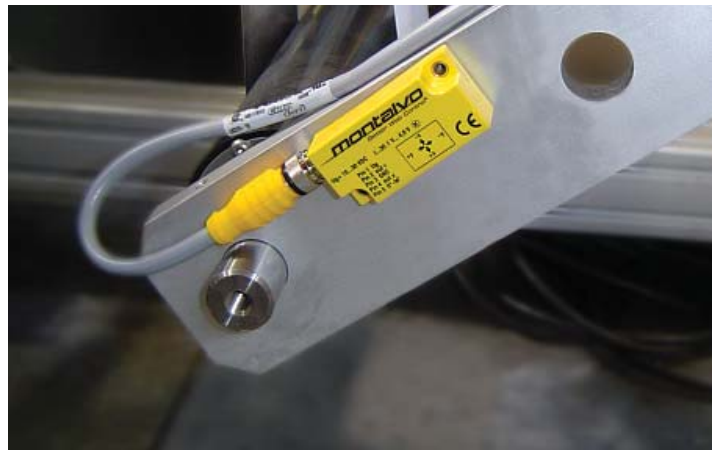
Montalvo DPS-1 mounted to a dancer arm running a foil that requires quick and accurate feedback.